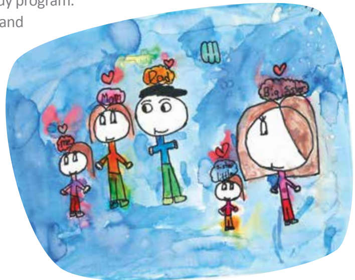
Artwork by a Raphael House child

By fiscal year 2017, we will serve 200 more families annually through our Residential Shelter and Bridge programs, a 67% increase in services overall.